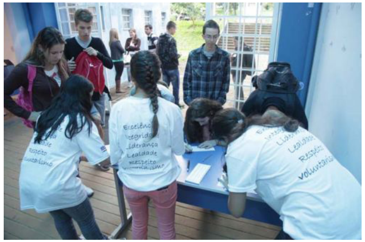
Autor: G.K. Wiecheteck.

Figure 1 - Student volunteers at the Welcome to the Family Induction Ceremony. Wearing their T-shirt with values, Excellence, Integrity, leadership, Loyalty, Respect and Voluntarism