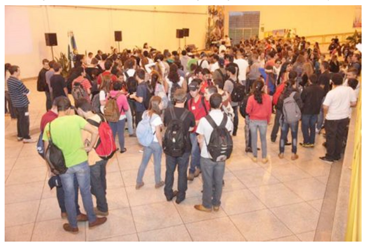
Autor: G.K. Wiecheteck.