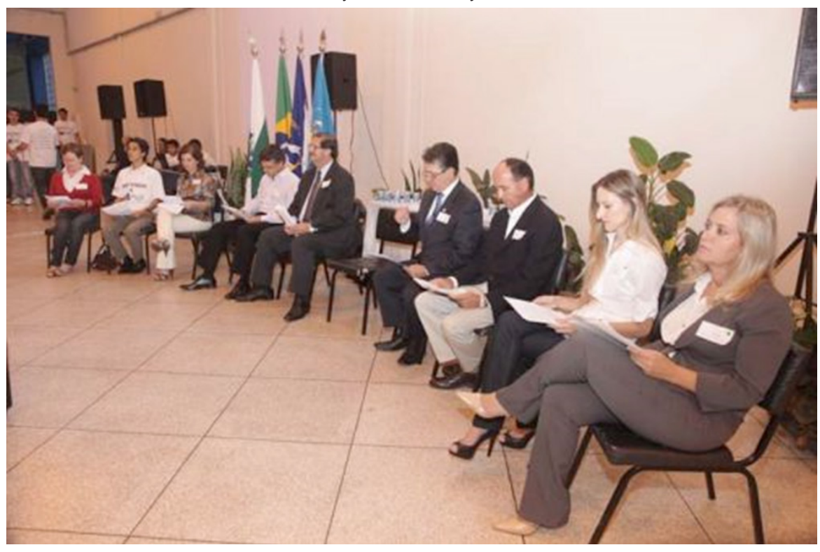
Figure 3 - Panel of Speakers for the Induction Ceremony, including alumni representatives from State Government, Industry, the University and Student Leaders